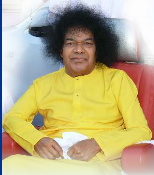
An Offering Of Love To Our Beloved Lord

The years 2018 and 2019 are festive years for the SAI world, since we are celebrating the golden jubilees of so many grand organisations and institutions, initiated and started by our beloved Master Bhagawan Sri Sathya Sai Baba, for the betterment of society and the establishment of Dharma. The epoch-making year of 1968 was witness to – the first World Conference of the Sri Sathya Sai Seva Organisations (SSSSO) and the inauguration of Dharmakshetra, both at Mumbai in May 1968. The succeeding year, in early 1969, Bhagawan directed the members of the Mahila Vibhag (women's wing) of SSSSO, to start value based classes for children, and thus was born the Sri Sathya Sai Bal Vikas, the children's wing of the SSSSO.