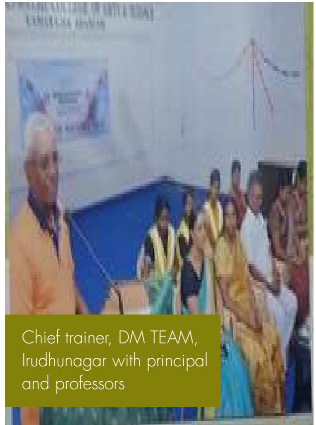
Chief trainer, DM TEAM, Irudhunagar with principal and professors