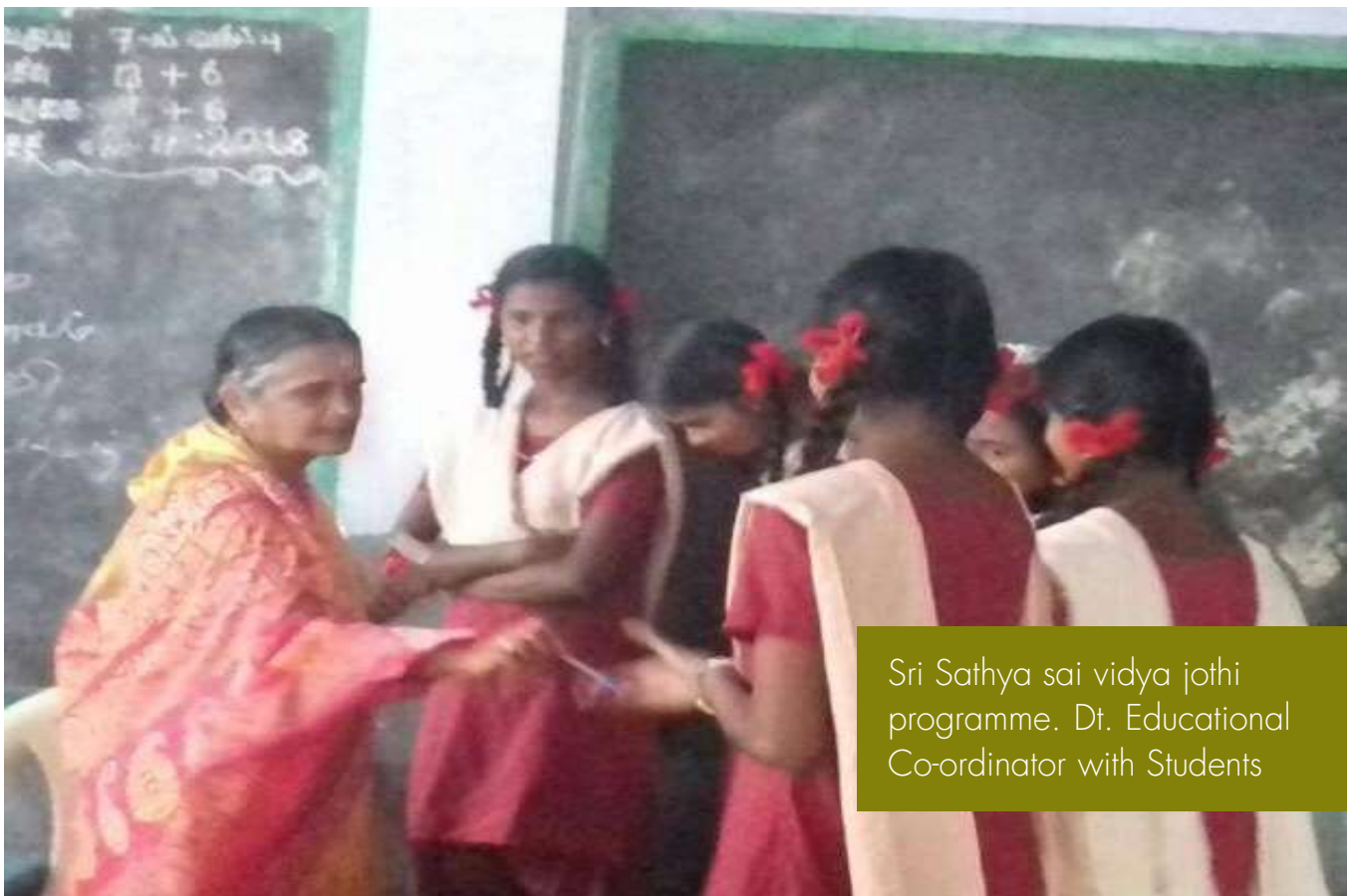
Sri Sathya sai vidya jothi programme. Dt. Educational Co-ordinator with Students