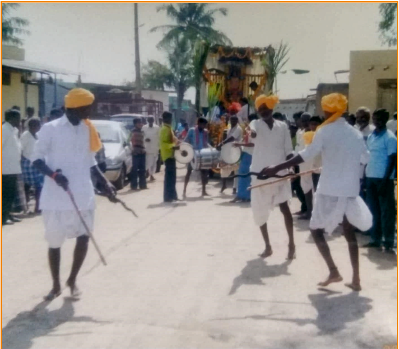
Traditional Village Martial arts finds a place in Bhagawan's Pallaki seva.