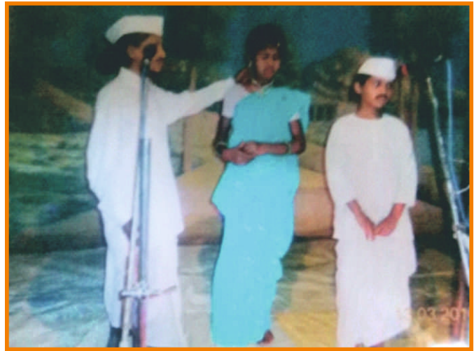
Balvikas children to the fore with absorbing drama of elevating stories.