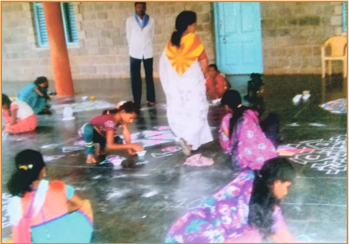
Another Traditional Art, Rangoli Drawing, also gets an opportunity to display and excel.