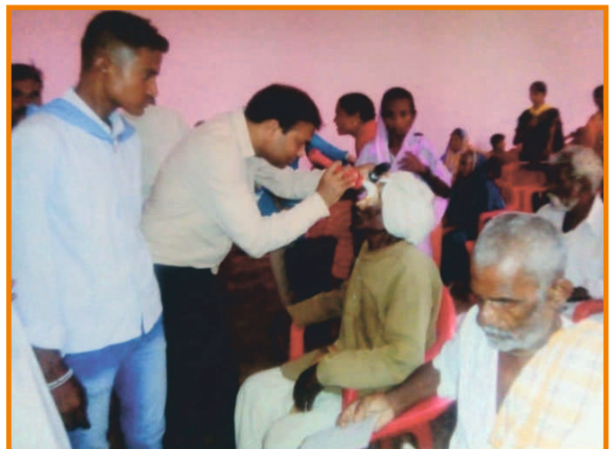
Narayan Seva is an essential part of every activity and is carried out with love.