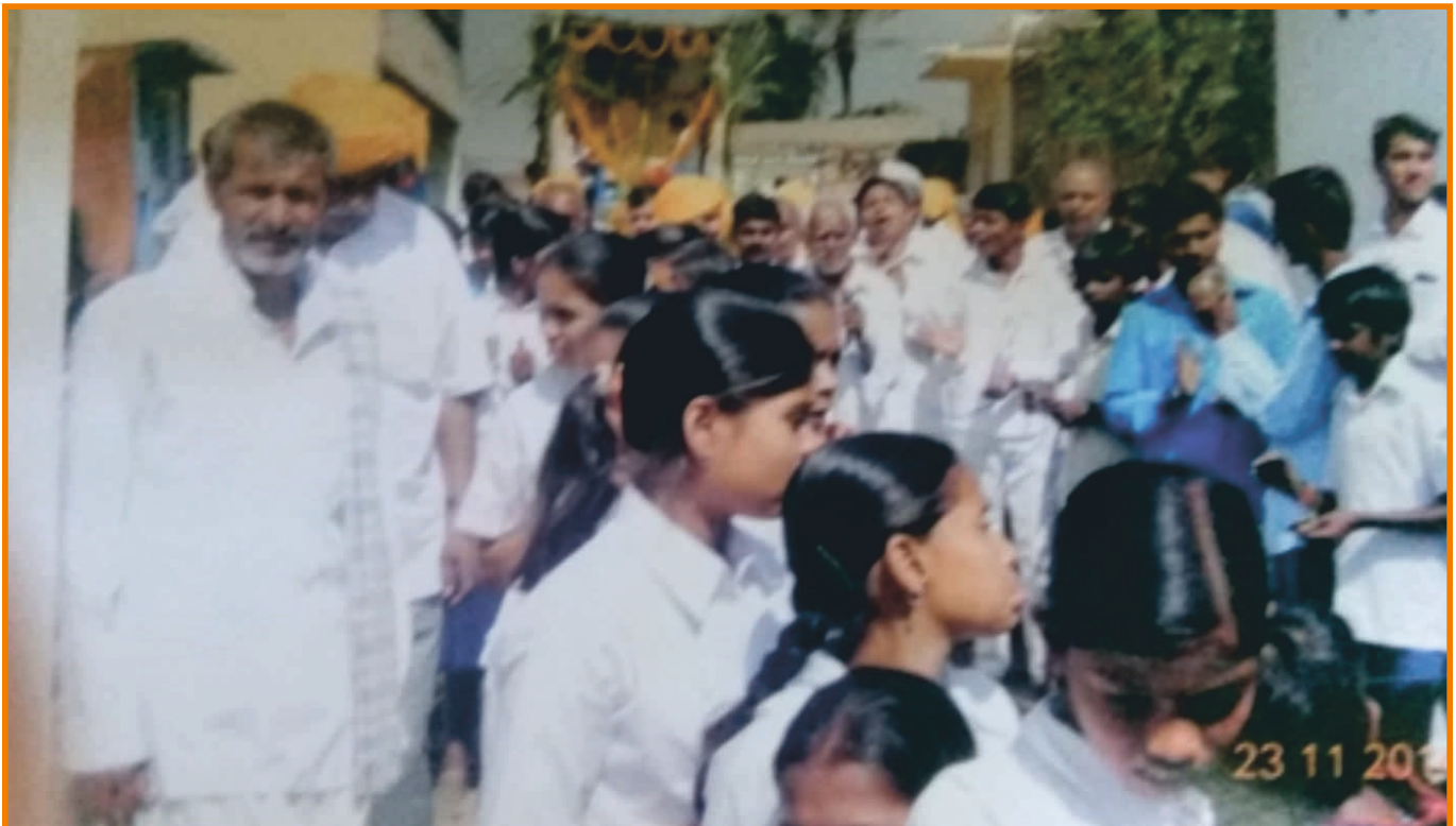
Bhagawan comes to the villages to bless His Devotees!