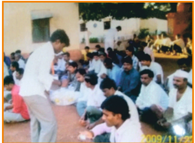
Narayan Seva is an essential part of every activity and is carried out with love.