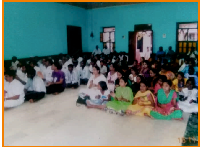
Singing the Lord's glorious names: Akhanda Bhajan – Balvikas children also participate actively.