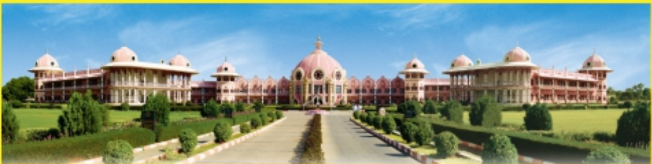
SATHYA SAI SUPER SPECIALITY HOSPITAL Puttaparthi Andhra Pradesh