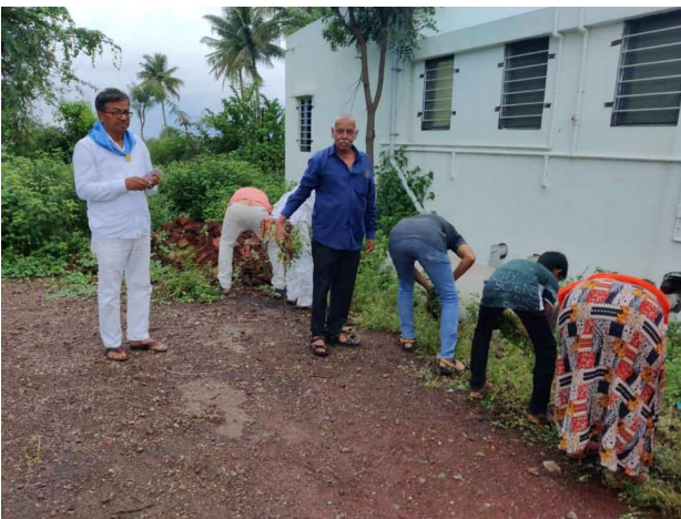
At miraj samithi

Swachhata abhiyan was conducted regularly at Sri Sathya Sai Seva Kendra Miraj, mandir at Belanki ,kavthemahankal &kundal samithi.