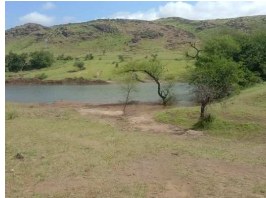
Gaontalav work at kuktoli village , tal – kavahtemahankal