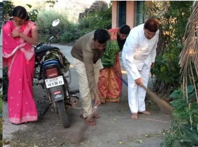
At kundal samithi