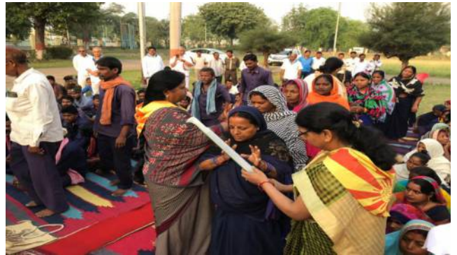
Seva at Jwalamukhi Mandir.