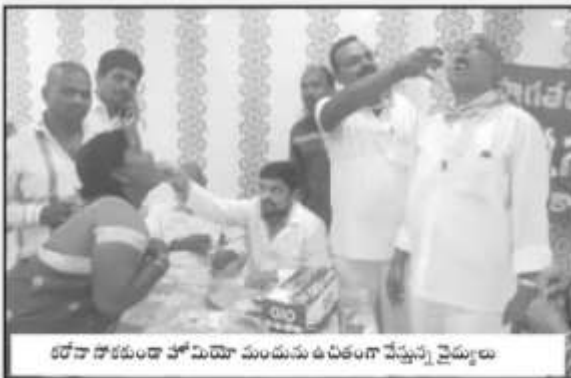
రోనా నాశకుండా హోమియో మందును ఉచితంగా వేస్తున్న వైద్యులు

కోటబొమ్మలూరి, మార్చి15 (ప్రభ న్యూస్): ప్రపంచాన్ని గజగజా వణికిస్తున్న క