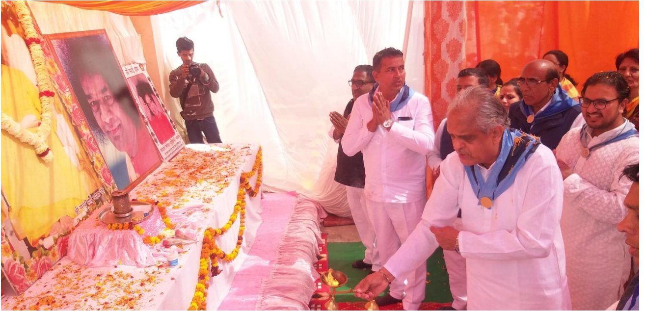
Aarhi performed by AIP Sir