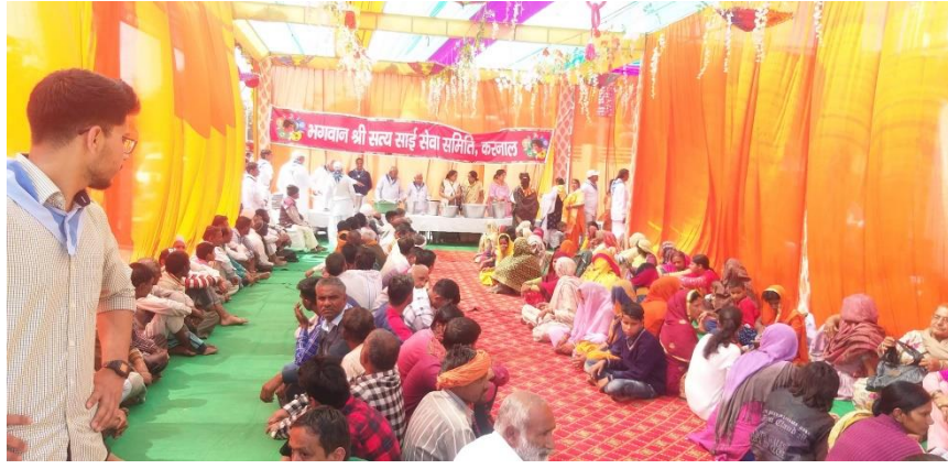
Narayan Seva During AIP Visit