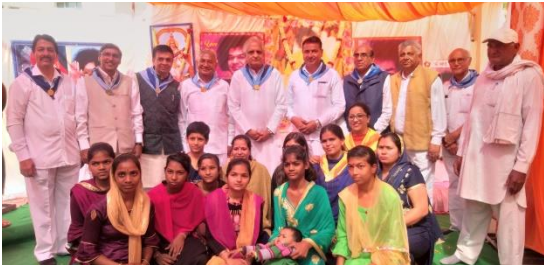
Youth and AIP Sir