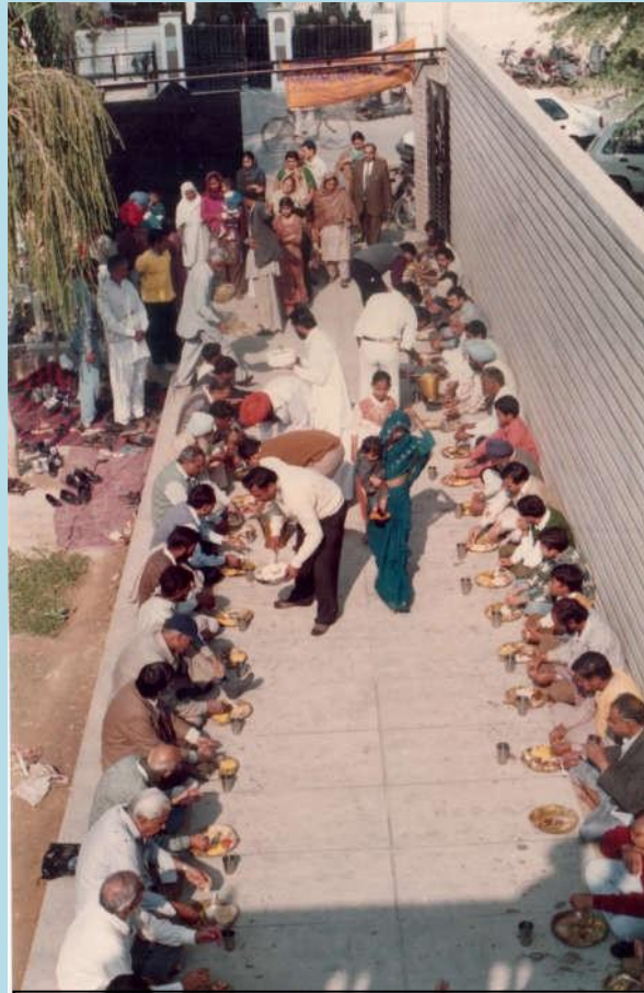
Narayan Seva for Patients and their Attendants during Free Surgical Camp