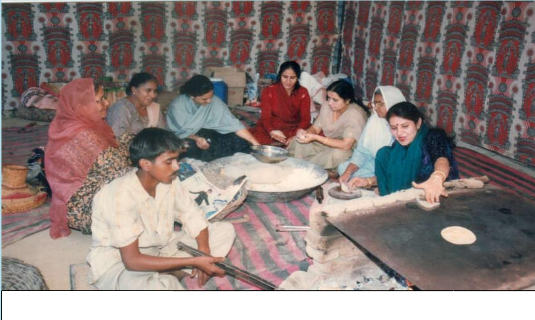
Food Preparation for Patients during Free Surgical Camp by Devotees of Sri Sathya Sai Seva Samithi, Abohar

Since 1997, the camps are being held every year (annual basis) in the month of November. So far we are blessed to hold 22 free surgical camps. Pm 2019 we have done 140 registrations.