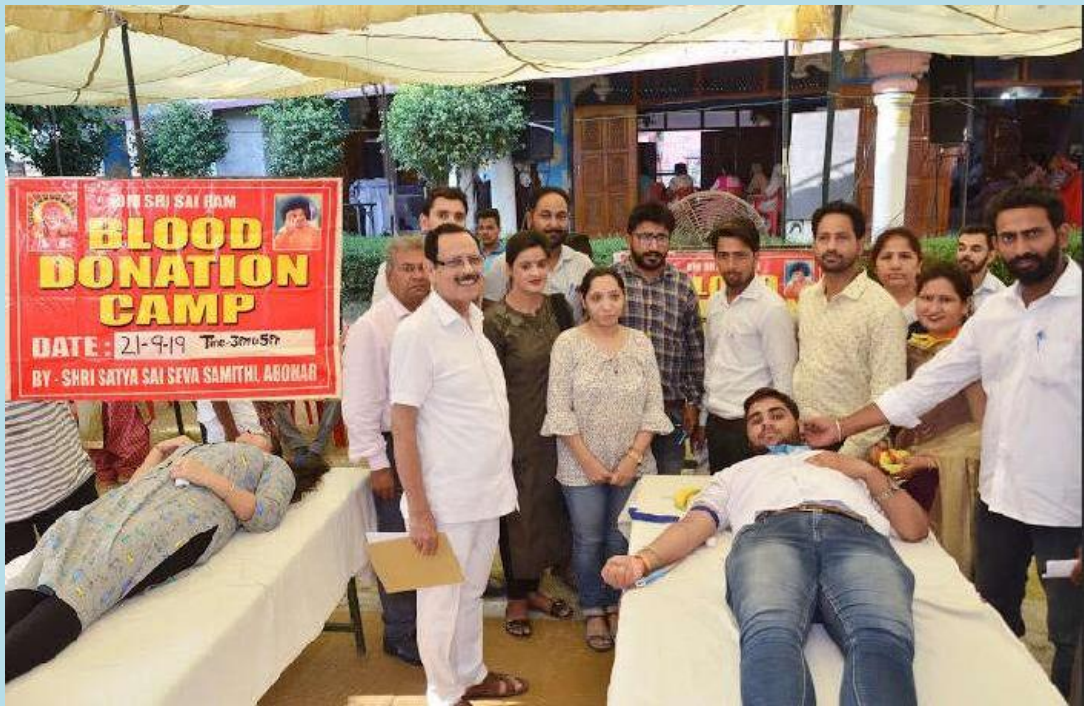
This year on 21.09.2019 -63 units of blood was donated.

Abohar and other devotees from Punjab Samithi's who are present on that particular day. Teams from Christian Medical College, Ludhiana, Dayanand Medical College, Ludhiana and local Civil Hospital, Abohar come for collection of donated blood.